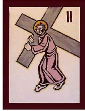
Soldiers put a heavy cross on Jesus' shoulders.