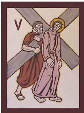
A man, Simon, helps Jesus carry his cross.

Can you think of a time when you were asked to help someone and did not want to help? Show Jesus what it was like when that happened, and picture Jesus loving you as you show him your heart. Maybe you can even hear Jesus whisper, "Thank you for helping." When you are ready, you can ask Jesus to help you to have a helping heart.