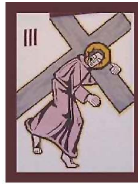
Jesus falls the first time.