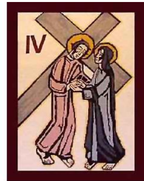
Jesus meets his Mother.