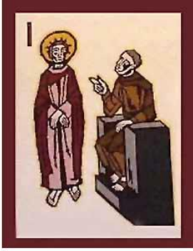
Jesus stands before a judge, Pontius Pilate. The judge tells Jesus that he will die.