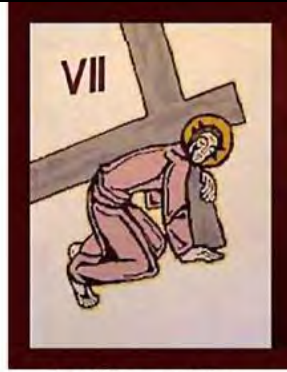
Jesus falls a second time.