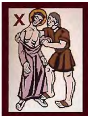
Jesus' clothes are taken away.

If you remember a time when something like this happened, remember how your heart felt. Then, show your heart to Jesus. You can ask Jesus to help you to have a heart that is like his heart.