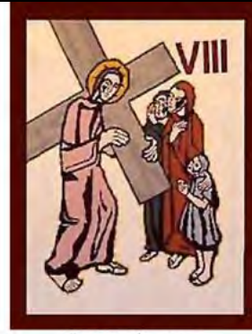
Jesus meets women who are crying.