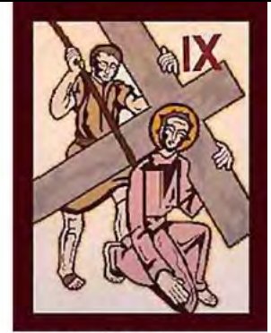
Jesus falls a third time.