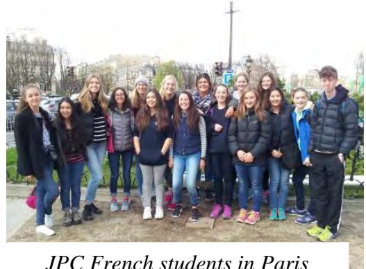
JPC French students in Paris

This year 16 senior French students (Years 11-13) took part in an exchange to France in March. We spent three days in Paris, cycling around Versailles (in the rain) and seeing some of the wonderful sights of Paris. Then we took a fast train down to the West coast to Les Sables d'Olonnes, a small tourist town, about an hour from Nantes. It has a beautiful beach and a real café culture. There the students met their homestay families and spent the next week with them. The students were, of course, very nervous but all went well. The families took them out at the weekends and the school organized trips during the day to Nantes, a brioche factory, a chocolate museum, a vineyard and to see a Molière play with the rest of the French Year 11 students. Eight days after arriving, it was time to say goodbye to the families and head for the sun on the South coast. The students who had been so nervous at the beginning said goodbye very sadly as they had had such a good time. We finished our trip by visiting Avignon (the Pope's Palace and Old Bridge), Arles (Van Gogh country), a perfume factory in Grasse and we finished with two nights in Nice.