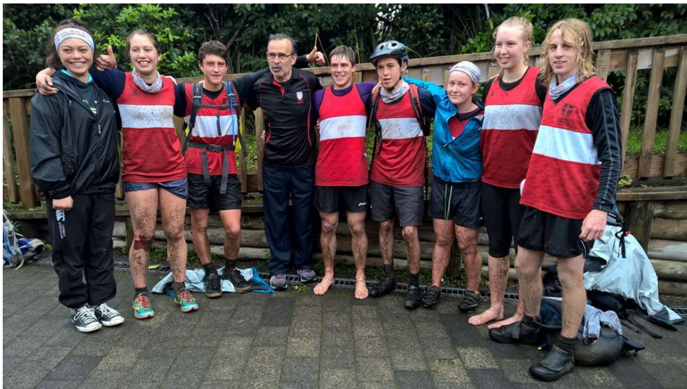
The finish line of multisport event and the end of a big week.

Synergy Award Prize: A weekend for 10 students at Hillary Outdoor Education with an instructor.