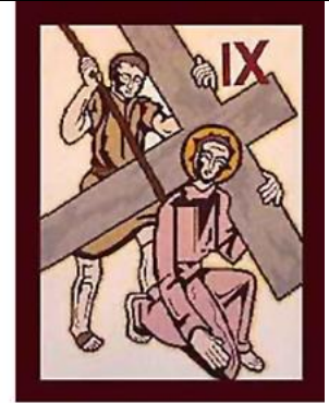
Jesus falls a third time.