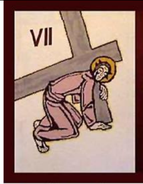
Jesus falls a second time.