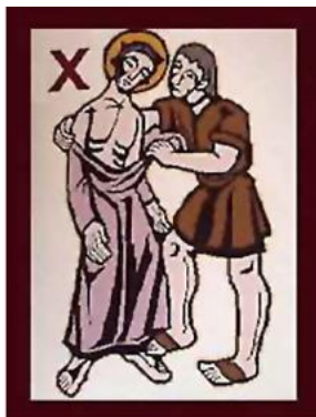
Jesus' clothes are taken away.

If you remember a time when something like this happened, remember how your heart felt. Then, show your heart to Jesus. You can ask Jesus to help you to have a heart that is like his heart.