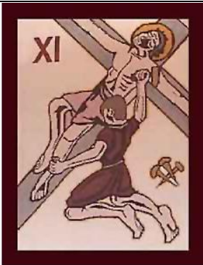
Jesus is nailed to the cross.