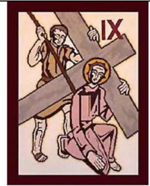
Jesus falls a third time.

Eleventh Station: Look at Jesus How much Jesus hurts as the soldiers nail him to the cross. He hurts all over; he is tired and thirsty; he knows that he is going to die. But he looks at the people who have hurt him and, instead of saying bad things to those people, Jesus asks God to forgive them. He looks at his mother and tells her to take care of others. Even when he is dying, Jesus is thinking of other people.